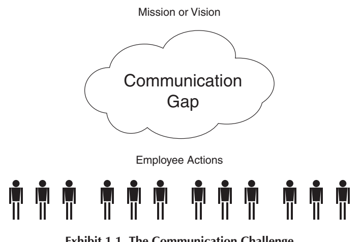
Exhibit 1.1 The Communication Challenge

If asked to briefly articulate their executive team's strategy, how many employees could do it? Probably very few—maybe none. The consequence of this is critical. If employee teams and managers do not understand their executive team's strategy, how do we expect them to understand that what they do each week and